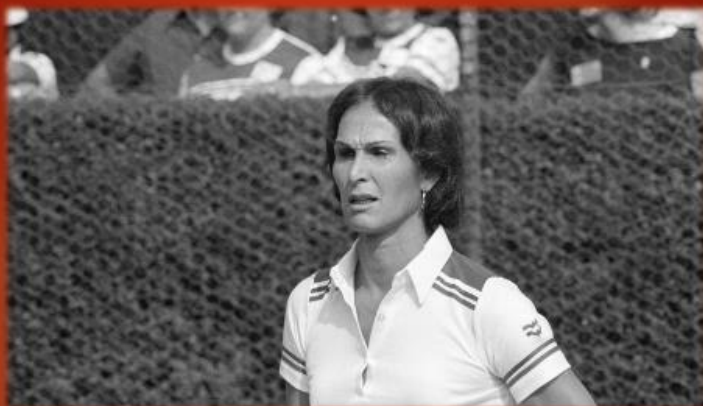
Dr. Renee Richards, Tennis Player, Ophthalmologist Trans Star

But, also Dr. Renee Richards a tennis player from the 70's, who competed as a woman in the 1976 U.S. Open