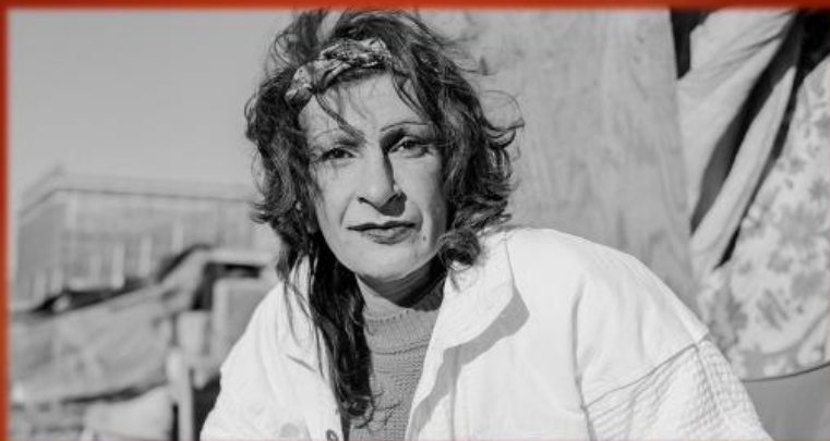
Sylvia Rivera, Stonewall Rebellion Leader, Activist Trans Champion