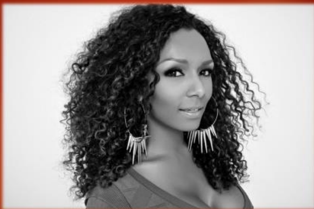
Janet Mock, Author, Activist, Trans Champion