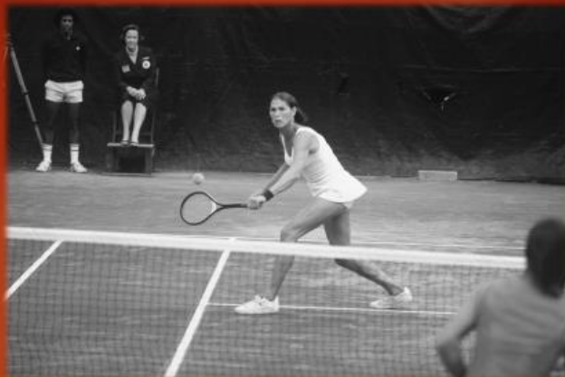
Dr. Renee Richards, Tennis Player, Ophthalmologist Trans Star

and Christine Jorgensen from the 50's. How many of you know who she was? Those of you who just put your hands up revealed your age.