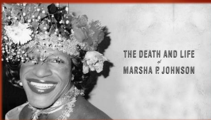
Marsha P. Johnson, Stonewall Rebellion Leader, Activist Trans Champion