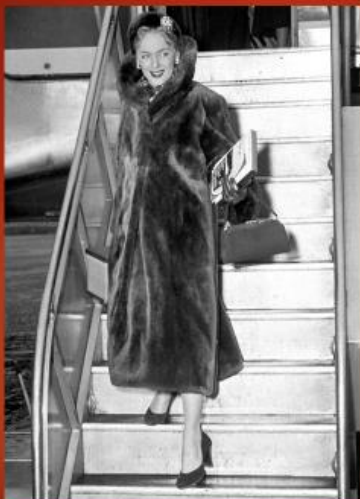
Christine Jorgensen, Pioneer Trans Star

Well, she has a very special meaning to me. When I was about 8 years old, I was thumbing through some old Look magazines and I came across a picture of her getting off a plane.