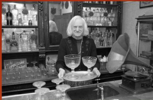
Charlotte von Mahlsdorf, Pioneer, Survivor, founder The Grunderzeit Museum Trans Humanist

She had an outlaw spirit and was an inspiration during a time that defined hard times.