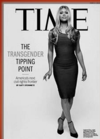
Lavern Cox, Actress Trans Star

But, also Dr. Renee Richards a tennis player from the 70's, who competed as a woman in the 1976 U.S. Open